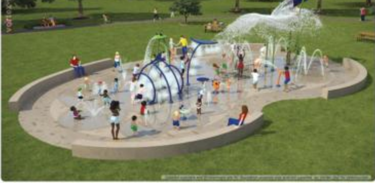
Beaufort Splashpad®, NC