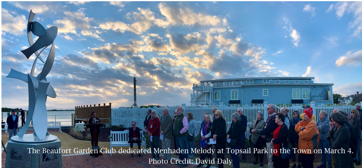
The Beaufort Garden Club dedicated Menhaden Melody at Topsail Park to the Town on March 4.