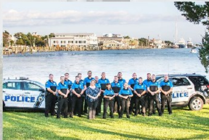
Beaufort Police Department 215 Pollock Street, Beaufort (252) 728-4561

Due to COVID-19, the meeting will be virtual and broadcast Live on the Town of Beaufort Police Department's and the Town of Beaufort's Facebook pages.