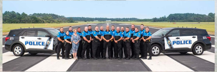
Beaufort Police Department 215 Pollock Street, Beaufort (252) 728-4561

The meeting will be in person at the Beaufort Train Depot, 614 Broad Street, and broadcast Live on the Town of Beaufort Police Department's and the Town of Beaufort's Facebook pages.