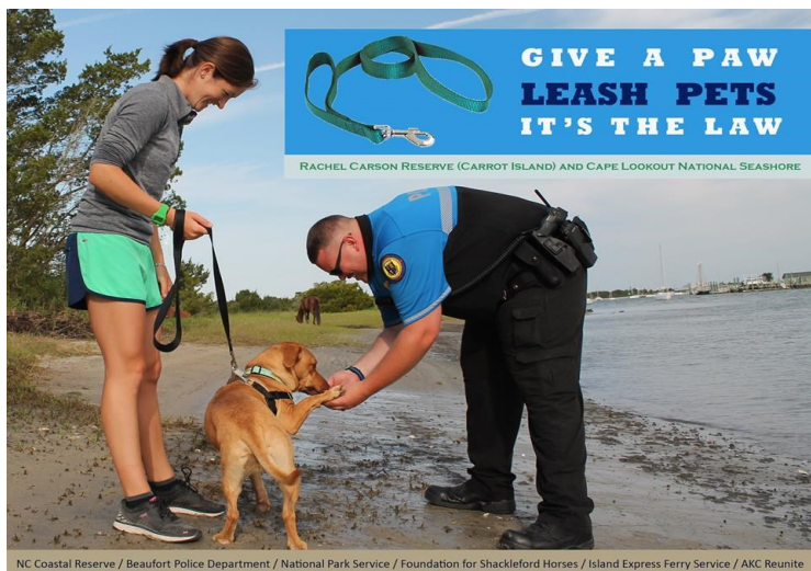
NC Coastal Reserve / Beaufort Police Department / National Park Service / Foundation for Shackleford Horses / Island Express Ferry Service / AKC Reunite

For more information on the Emergency Alert system, call (252) 528-8765.